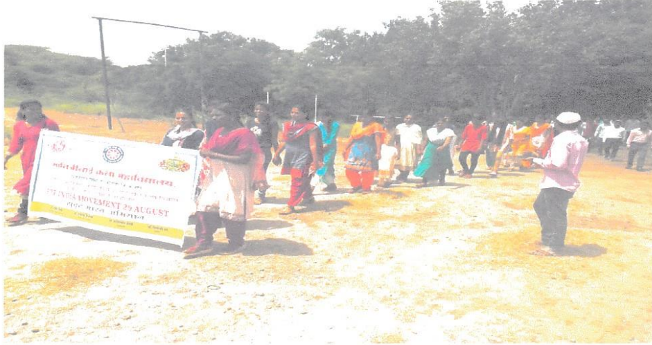
Fit India Movement Photo Date 30-08-2019